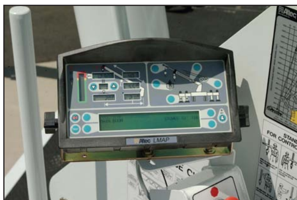
Altec LMAP System