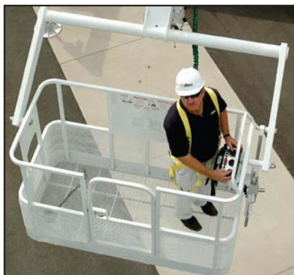
Optional 2-Man Platform

Ontario Service Center 831 Nipissing Road Milton, Ontario L9T 4Z4