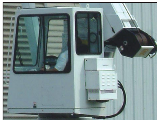
Optional Climate Controlled Enclosed Cab